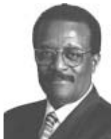
Johnnie L. Cochran Jr.

Renowned trial lawyer and civil libertarian.